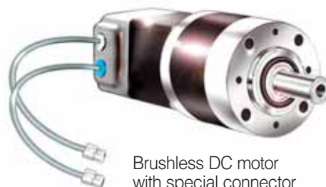
Brushless DC motor with special connector