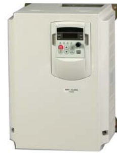
Frequency Inverters FUS 1500 ... 5500/3CV