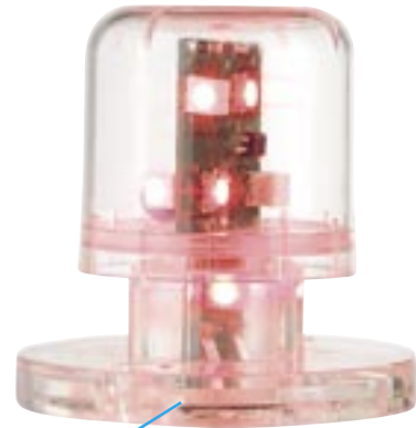
LED-bulb shown in socket