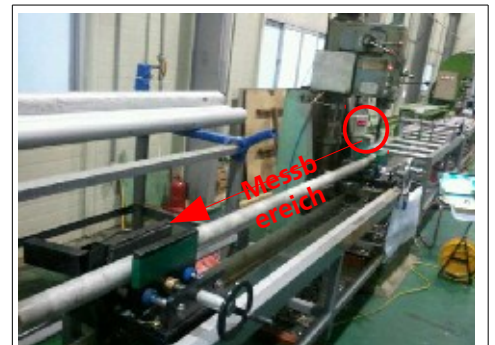
Pic 2: Measurement of the rear setting

Please click press here for additional information about products or applications