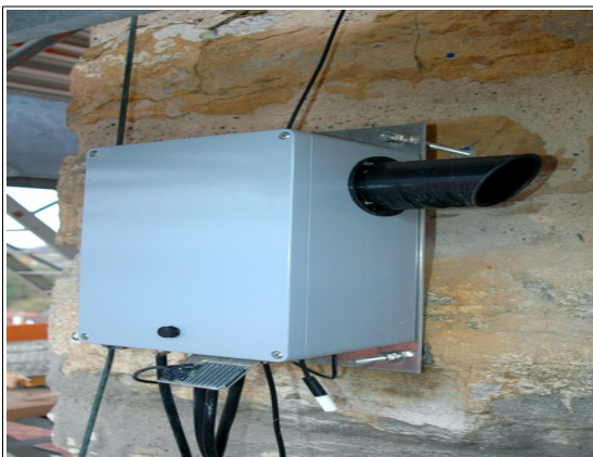
Pic 1: Dimetix Sensor installed at the historic building "Blauer Turm" in Germany.

Geodetic permanent monitoring of historic buildings are to support redevelopment concepts.